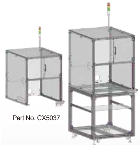
Part No. CX5037

Indicator above the cover make you confirm operation condition remotely.